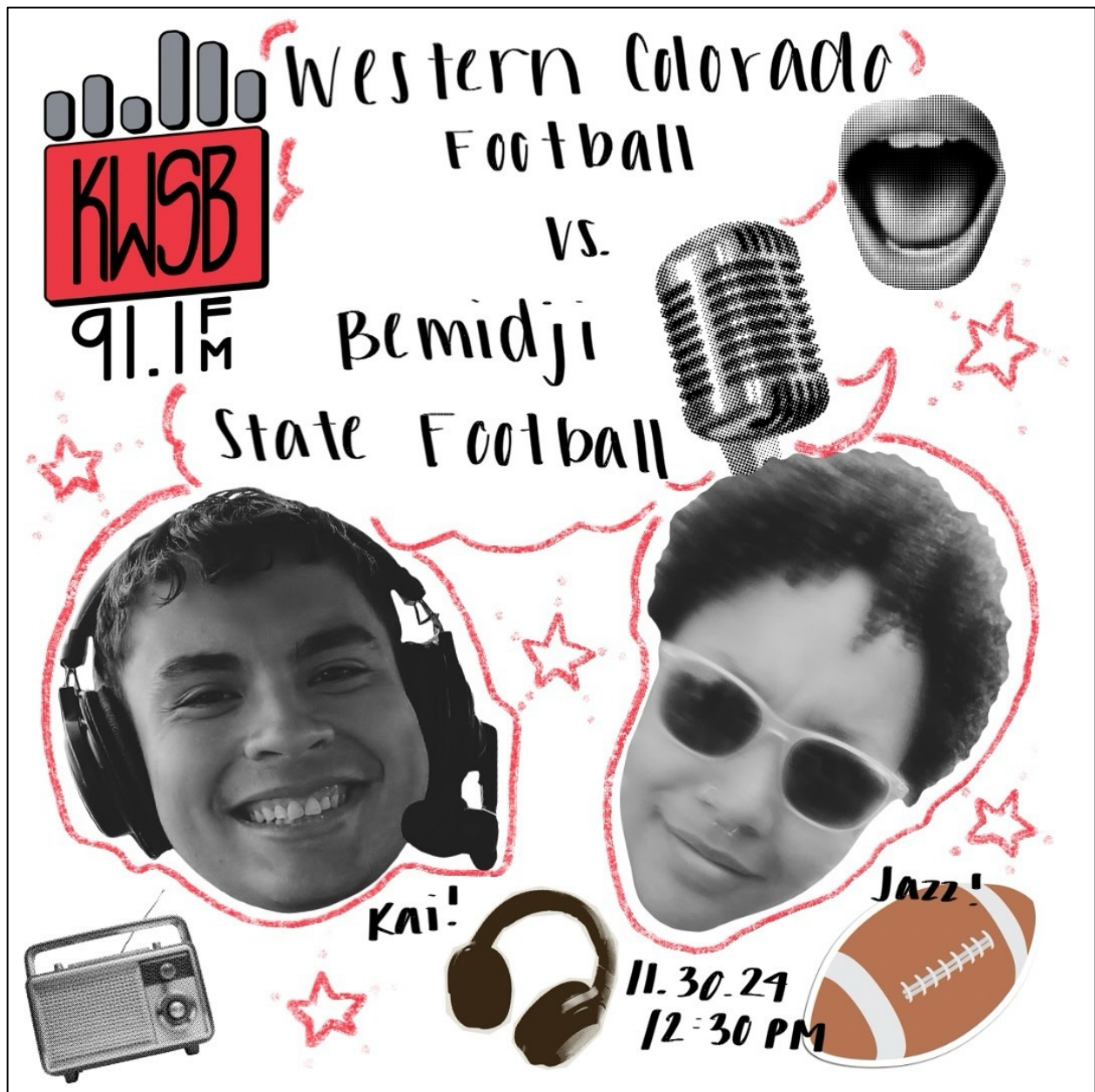
Appendix 6: Instagram post for KWSB 91.1 FM's live coverage of the Western Colorado University football game. The post highlights broadcast details and encourages audience engagement.