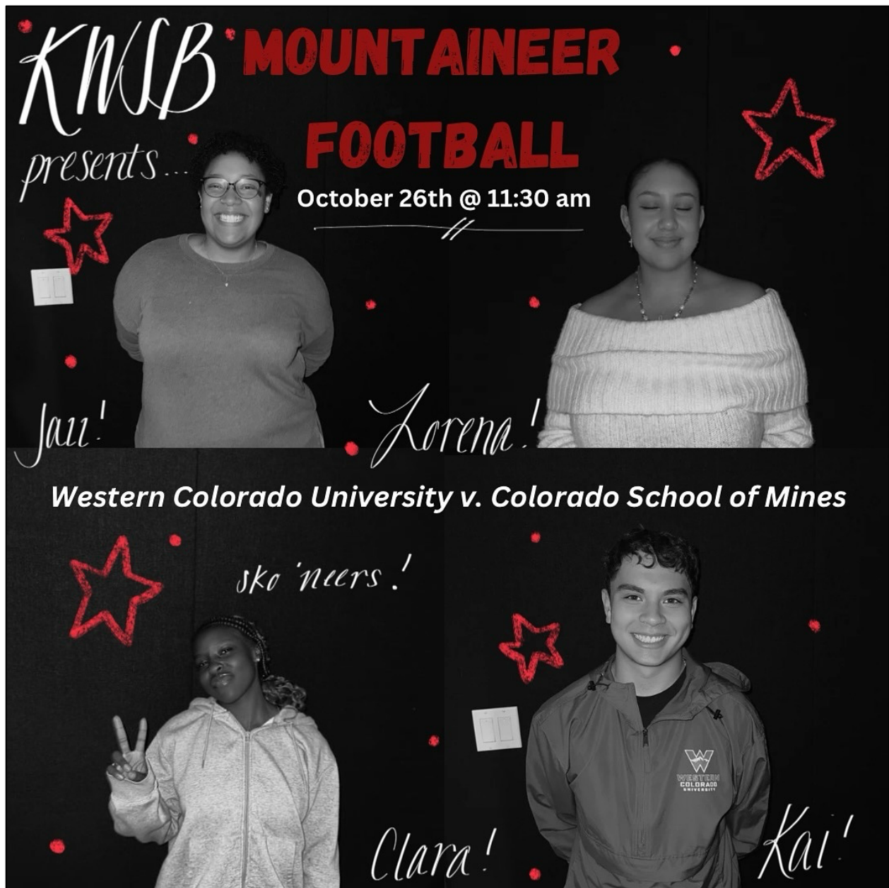
Appendix 1: Instagram post for KWSB 91.1 FM's live coverage of the Western Colorado University football game. The post highlights broadcast details and encourages audience engagement.