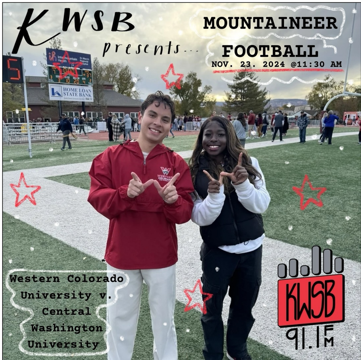
Appendix 5: Instagram post for KWSB 91.1 FM's live coverage of the Western Colorado University football game. The post highlights broadcast details and encourages audience engagement.