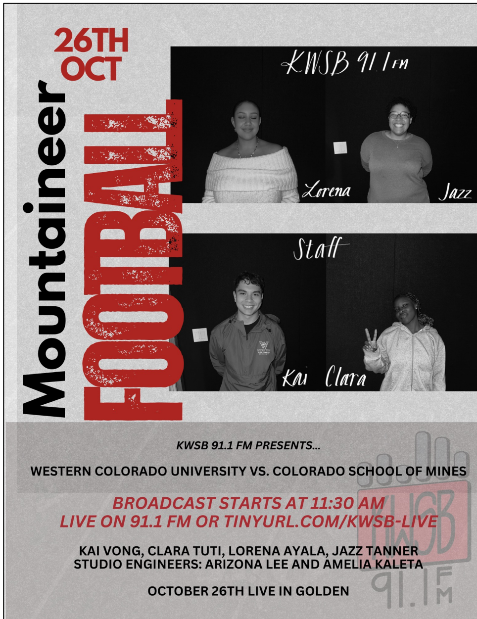
Appendix 2: Flyer promoting KWSB 91.1 FM's football game broadcasts, distributed via school emails and posted across campus, featuring schedules and streaming information to maximize visibility and attendance.