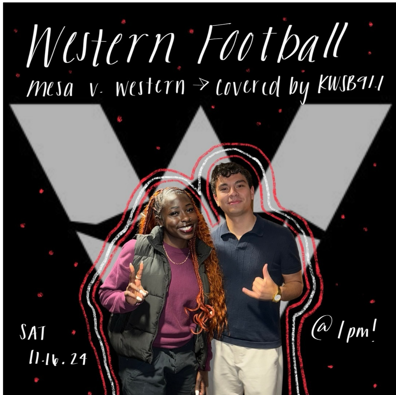
Appendix 3: Instagram post for KWSB 91.1 FM's live coverage of the Western Colorado University football game. The post highlights broadcast details and encourages audience engagement.